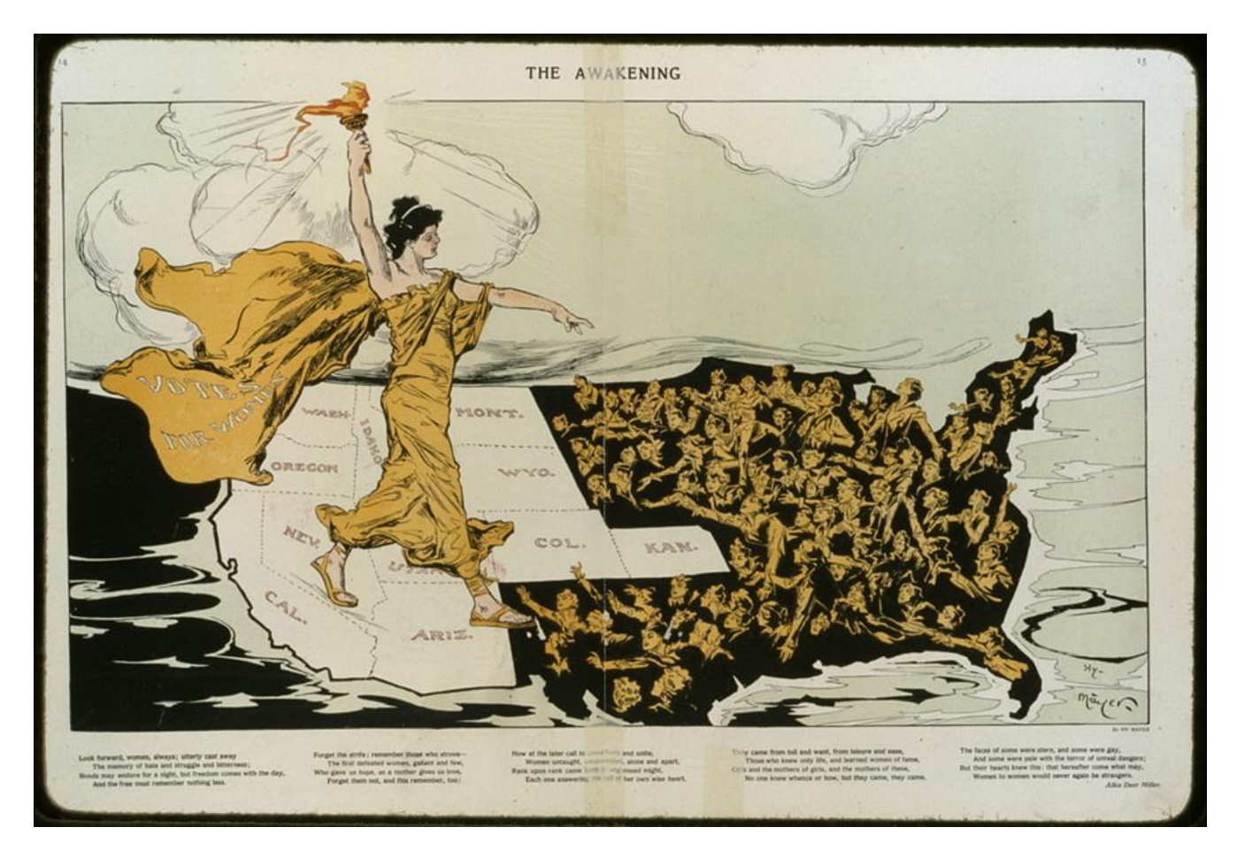
The Awakening, Library of Congress